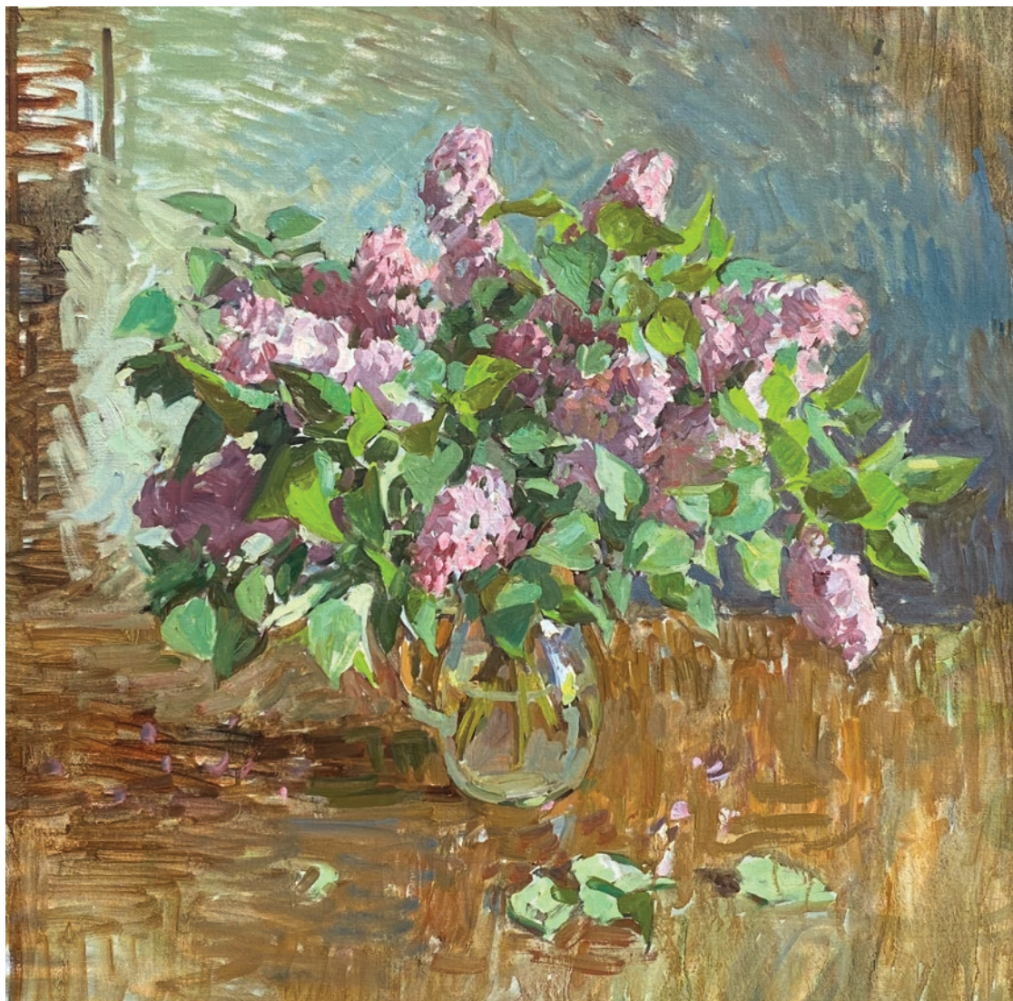
Lilacs on the Table 27.5 x 29.5 inches | Oil on linen | 2022