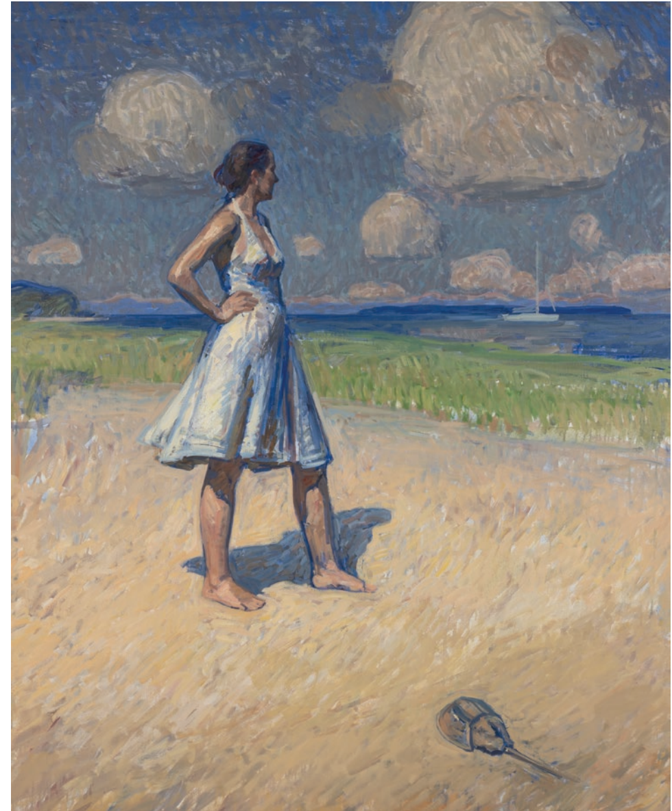
Horseshoe Crab 65 x 53 inches | Oil on linen | 2023