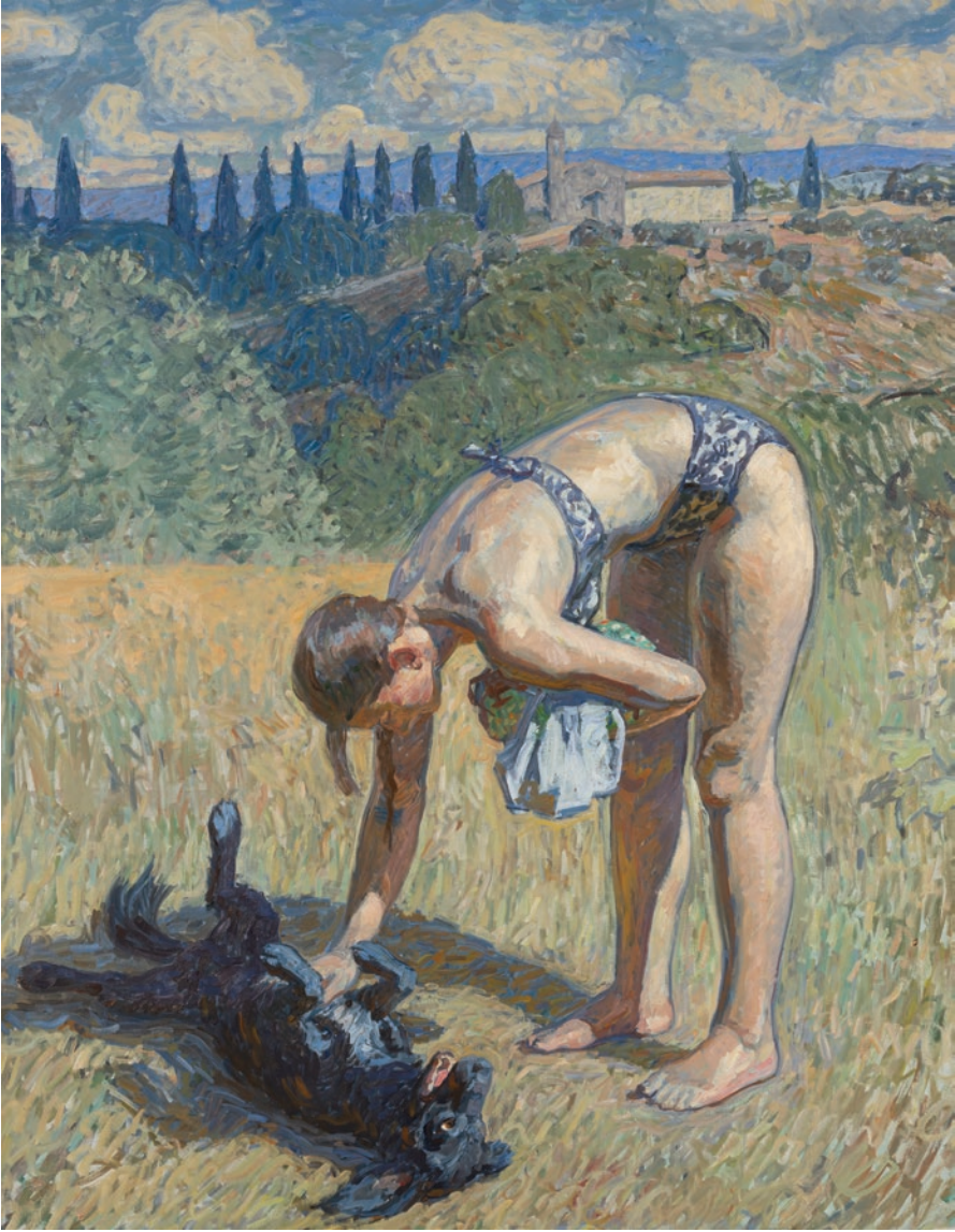
Amy, Buddy 75 x 59 inches | Oil on linen | 2022