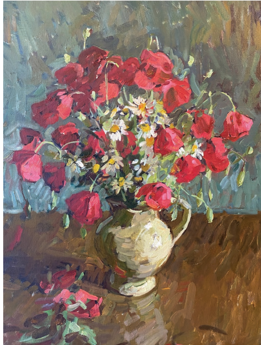
Poppies and Daisies 21 x 25.5 inches | Oil on linen | 2020