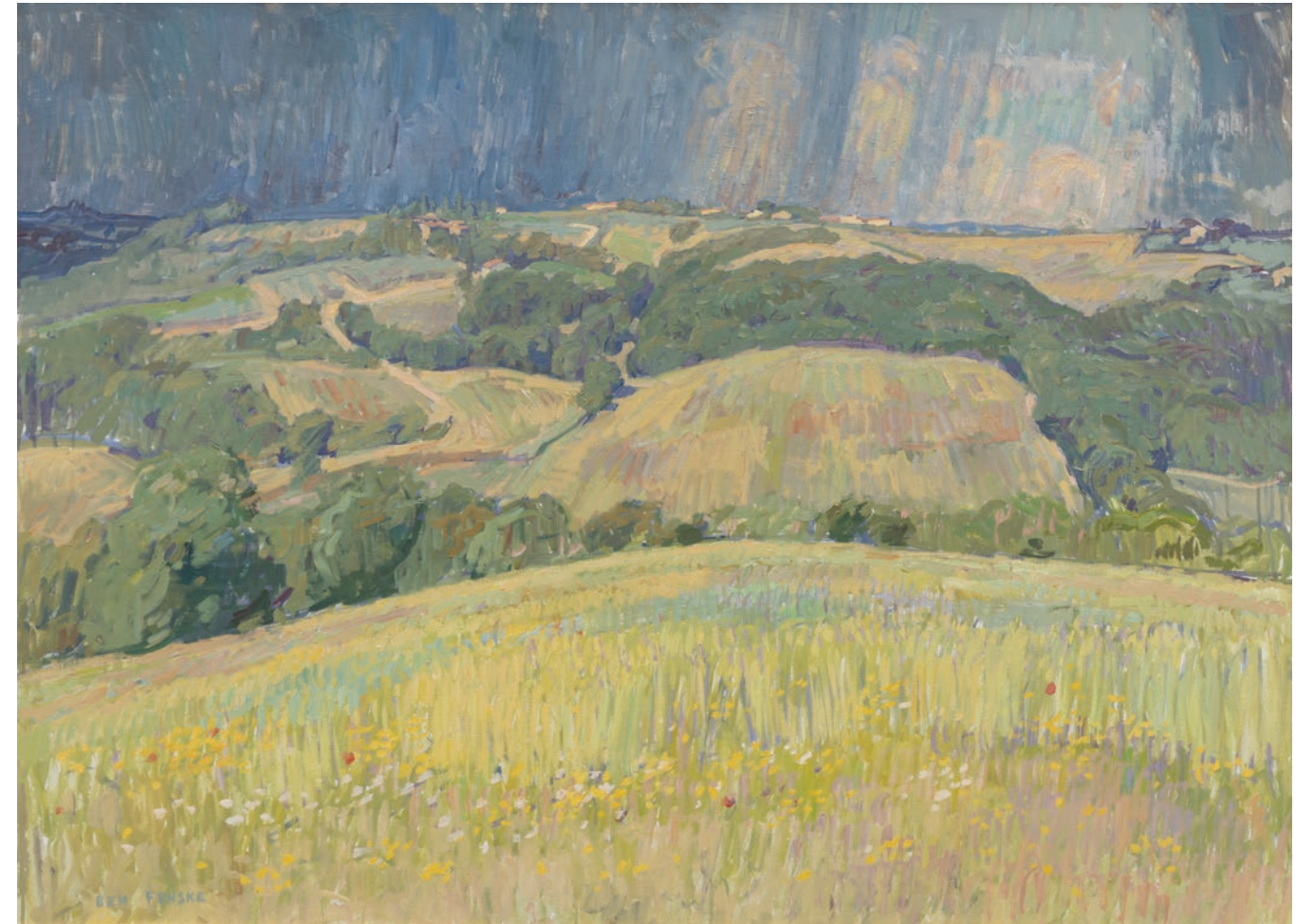
Wildflowers, Storm 43.5 x 59 inches | Oil on linen | 2021