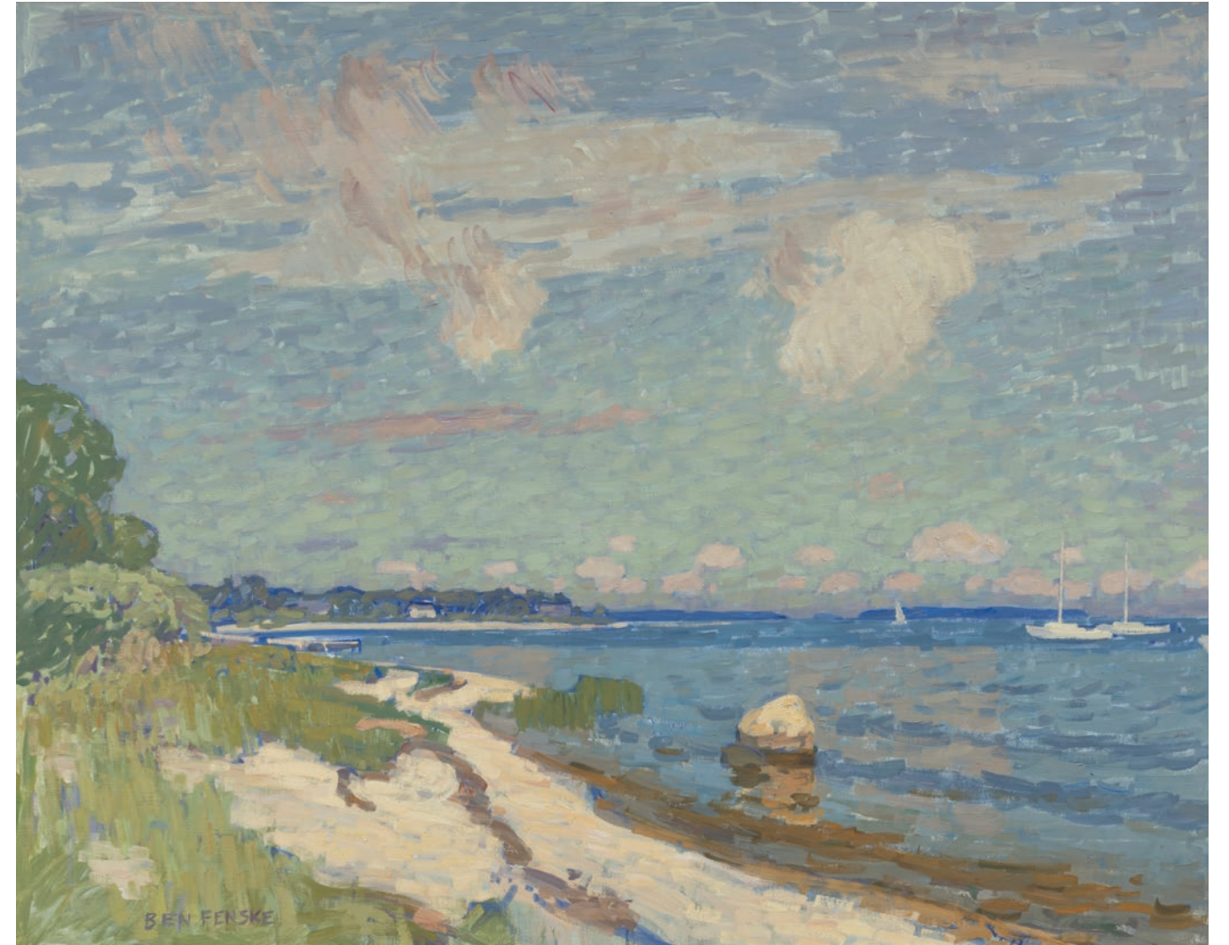
Secret Beach, Pink Clouds 47 x 59 inches | Oil on linen | 2021