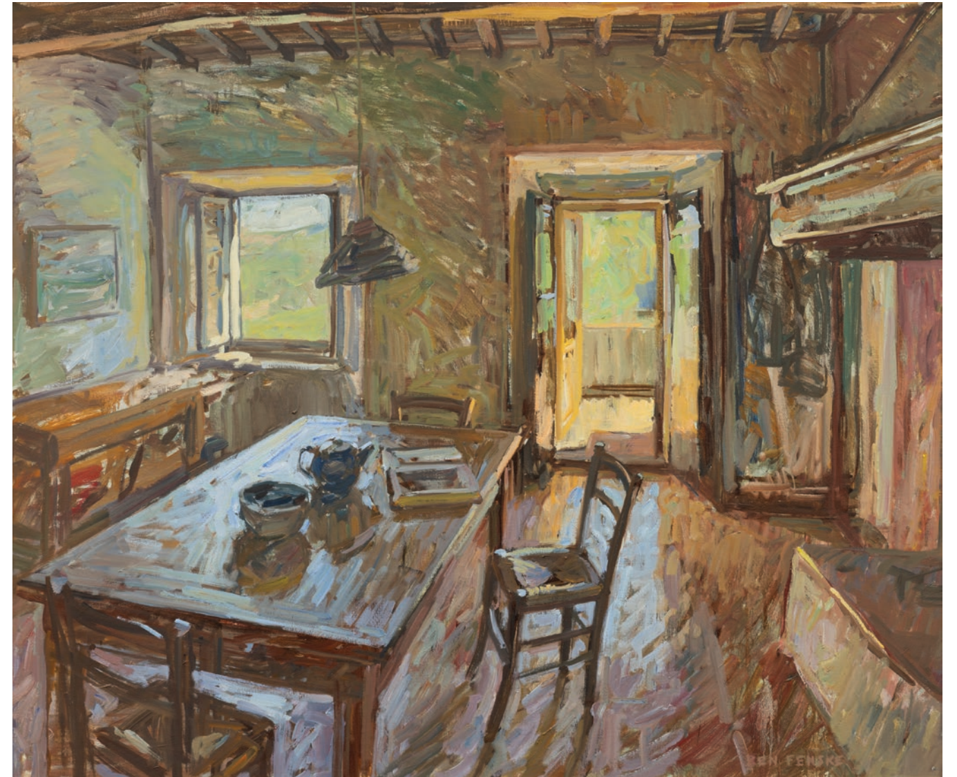
Bright Day, Interior 39.5 x 47 inches | Oil on linen | 2021