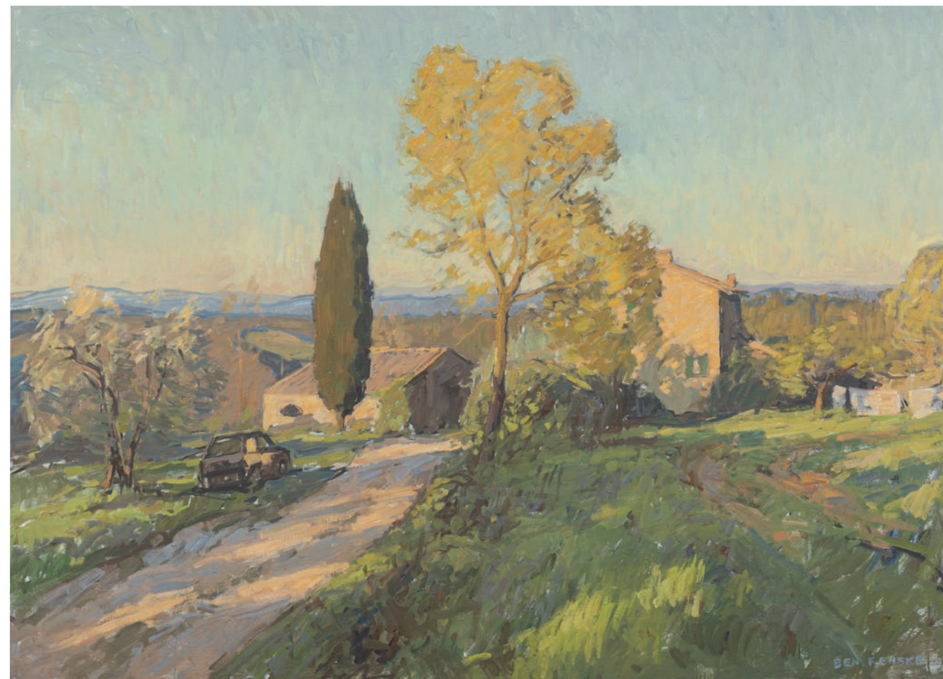
Road to the House 39.5 x 59 inches | Oil on linen | 2021