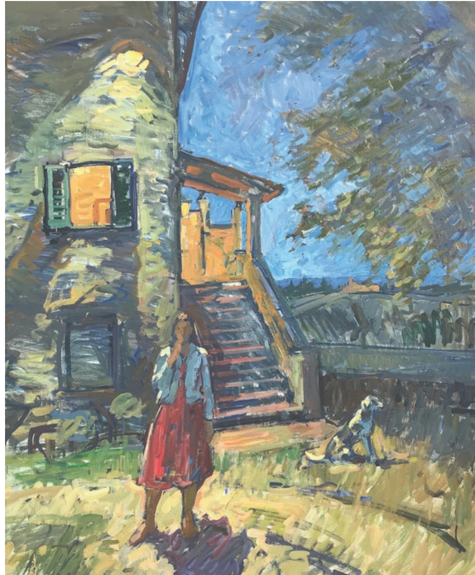
Twilight, Family 47 x 39.5 inches | Oil on linen | 2020