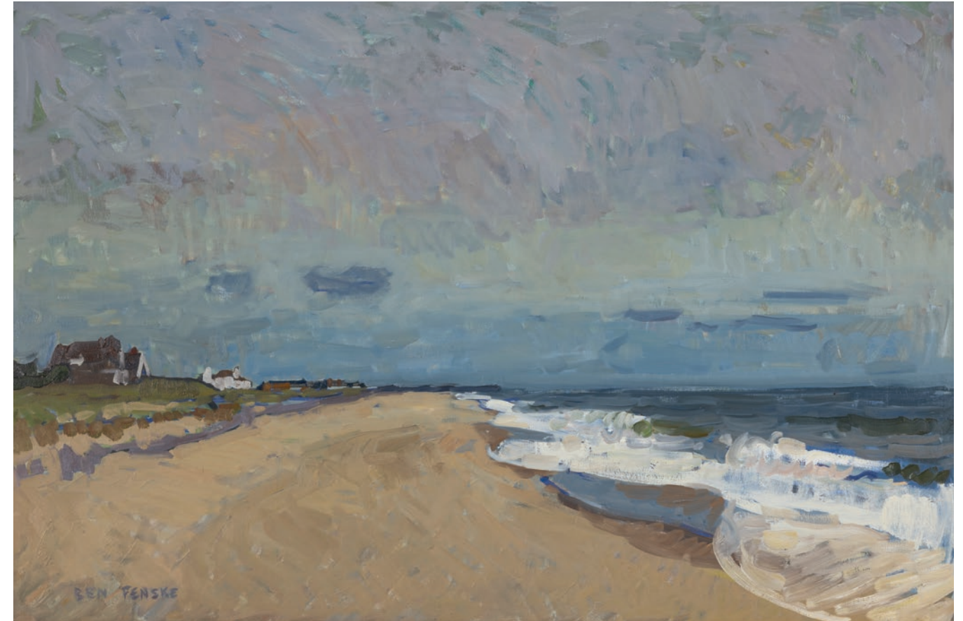
Peter's Pond, September 31.5 x 47 inches | Oil on linen | 2023