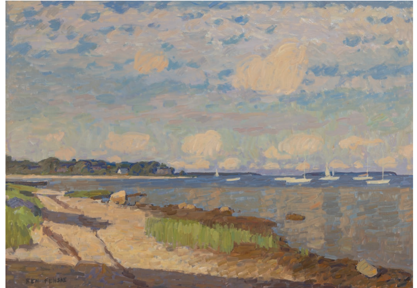
Secret Beach, Low Tide 39.5 x 55 inches | Oil on linen | 2023

Enough chit-chat. Fenske got down to painting.