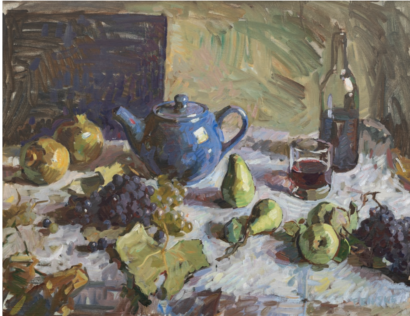
September Still Life 27.5 x 35.5 inches | Oil on linen | 2020