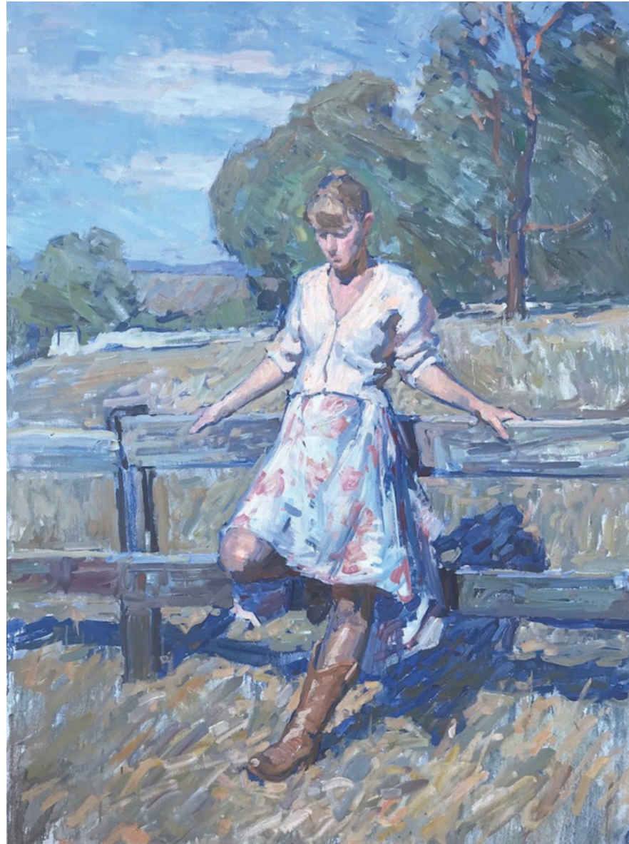
California Girl 53.5 x 39.5 inches | Oil on linen | 2021