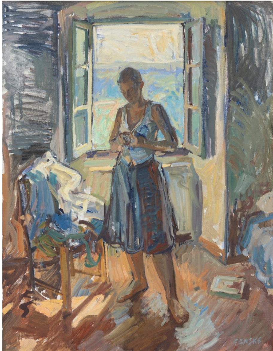
Girl, Morning 35.5 x 27.5 inches | Oil on linen | 2020