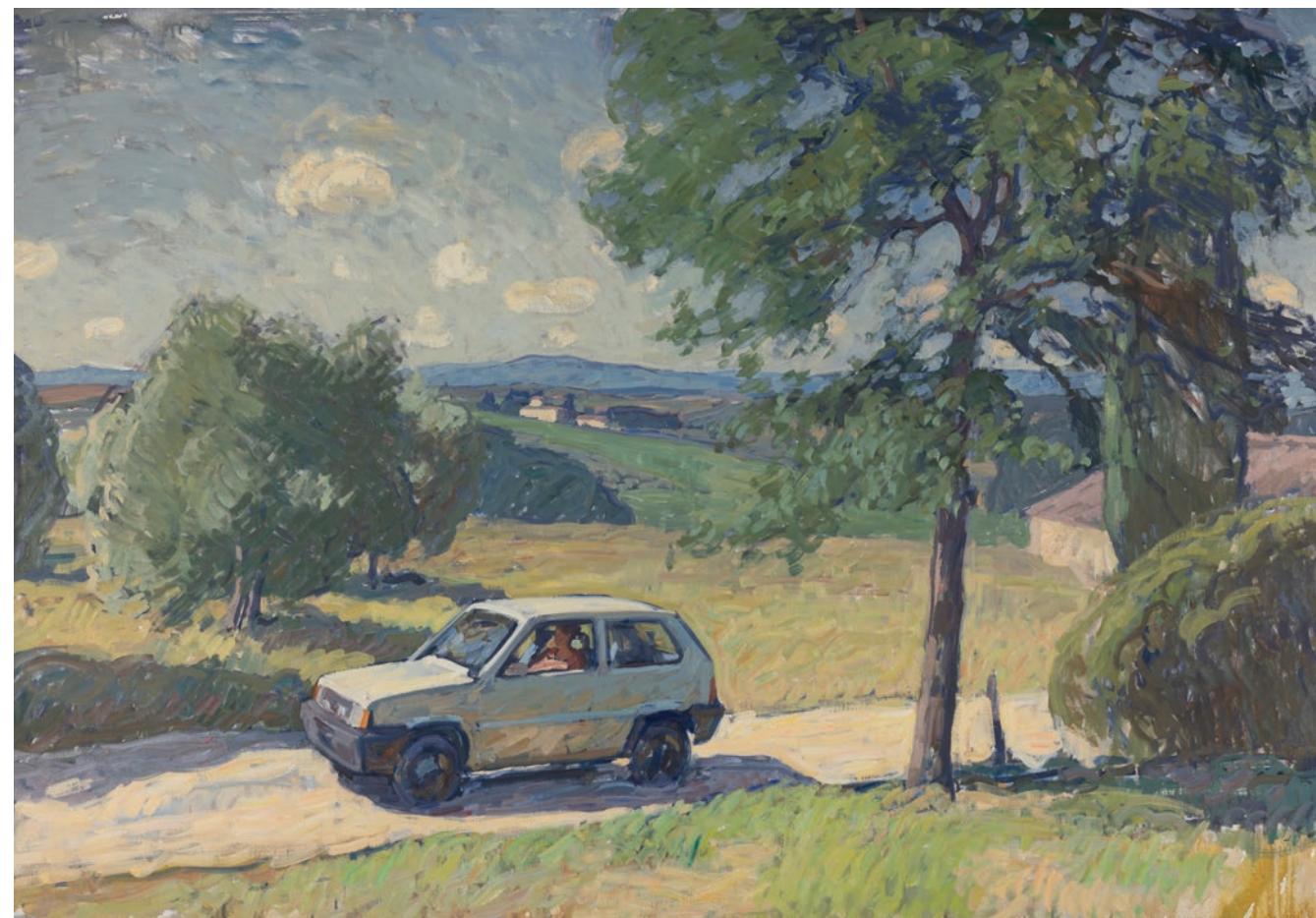
Summer 43.5 x 63 inches | Oil on linen | 2023