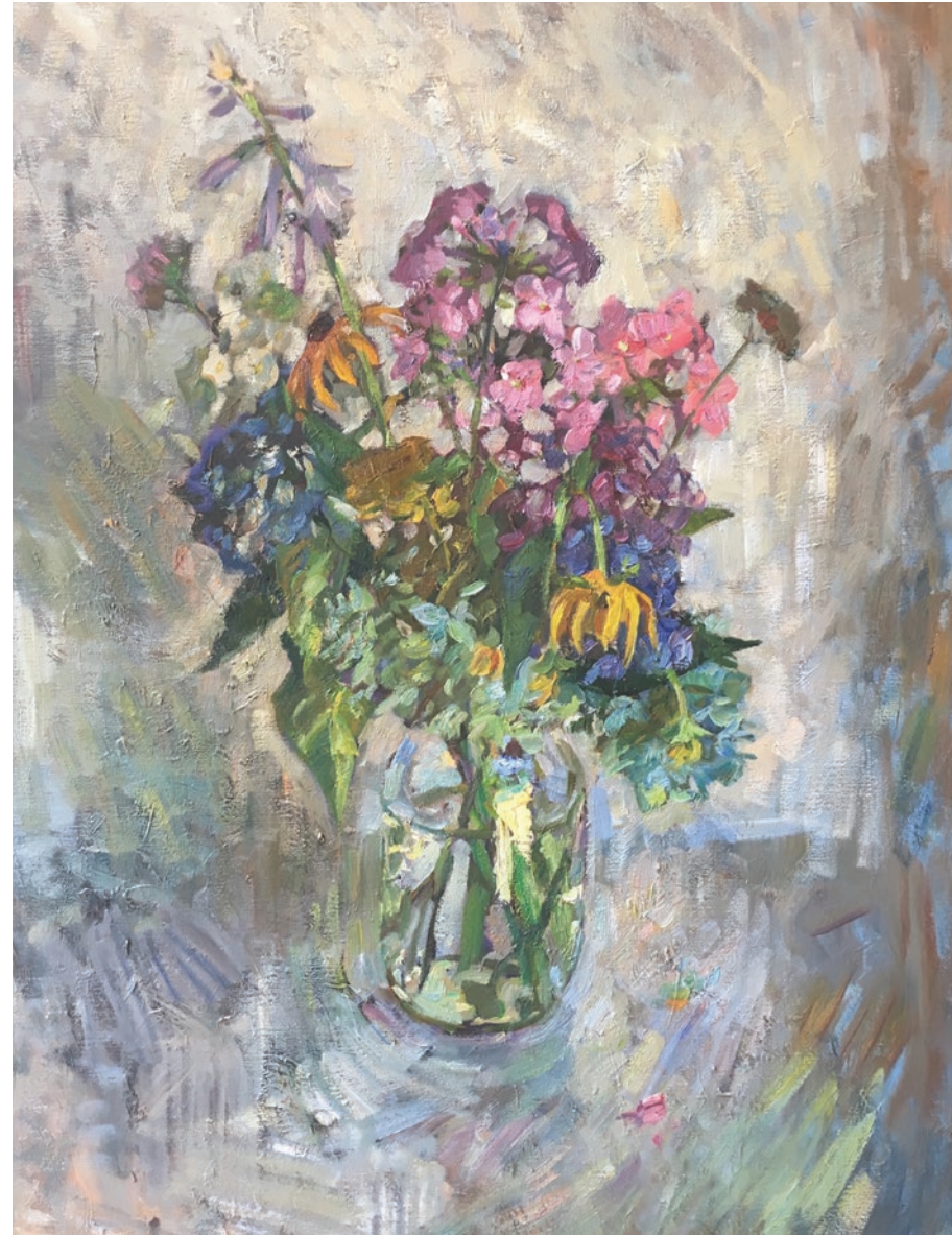
Ball Jar Flowers 27.5 x 21.5 inches | Oil on linen | 2017