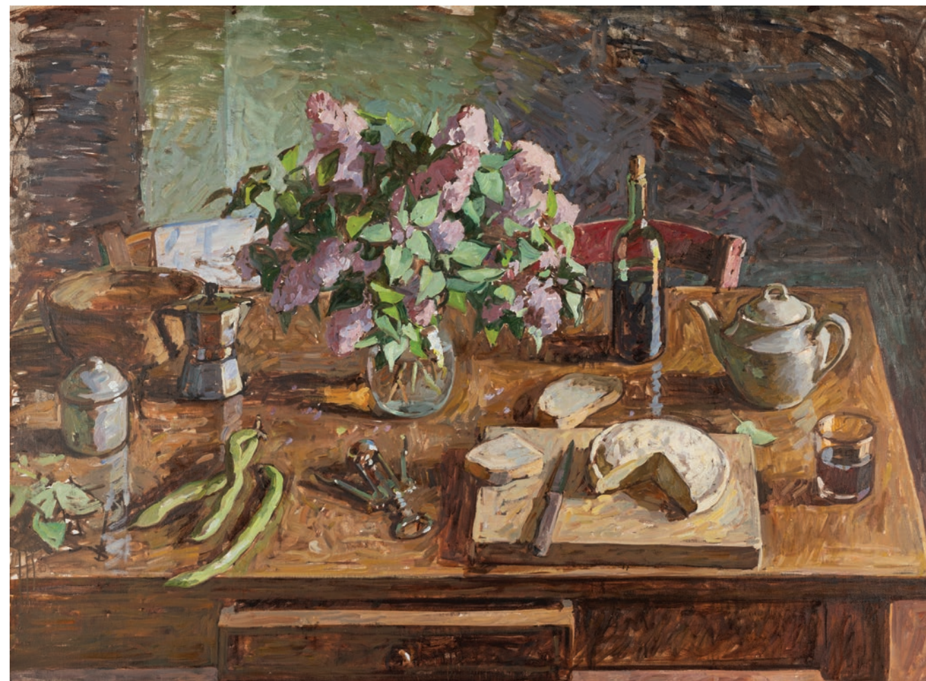
Lilacs, Coffee, Wine 43.5 x 59 inches | Oil on linen | 2023