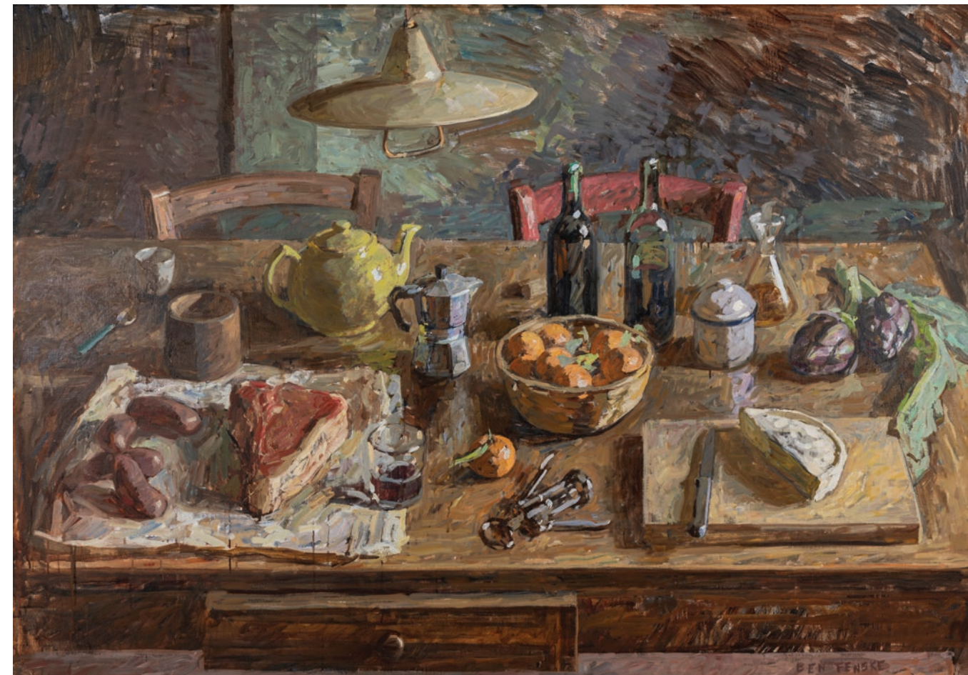
Winter Table 47.5 x 67 inches | Oil on linen | 2023