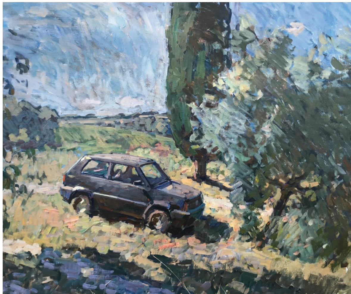
Parked Panda 27 x 35 inches | Oil on linen | 2019