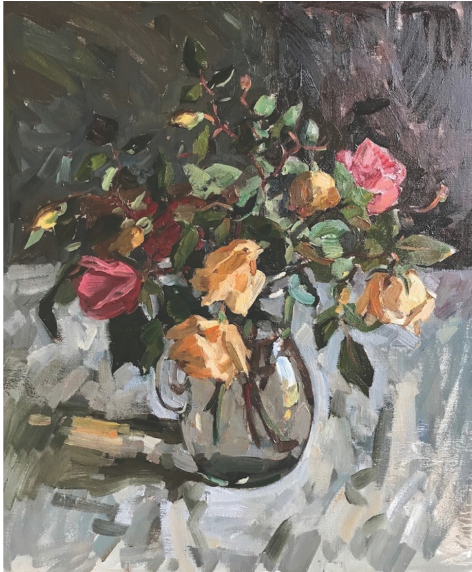
Roses 23.5 x 19.5 inches | Oil on linen | 2020