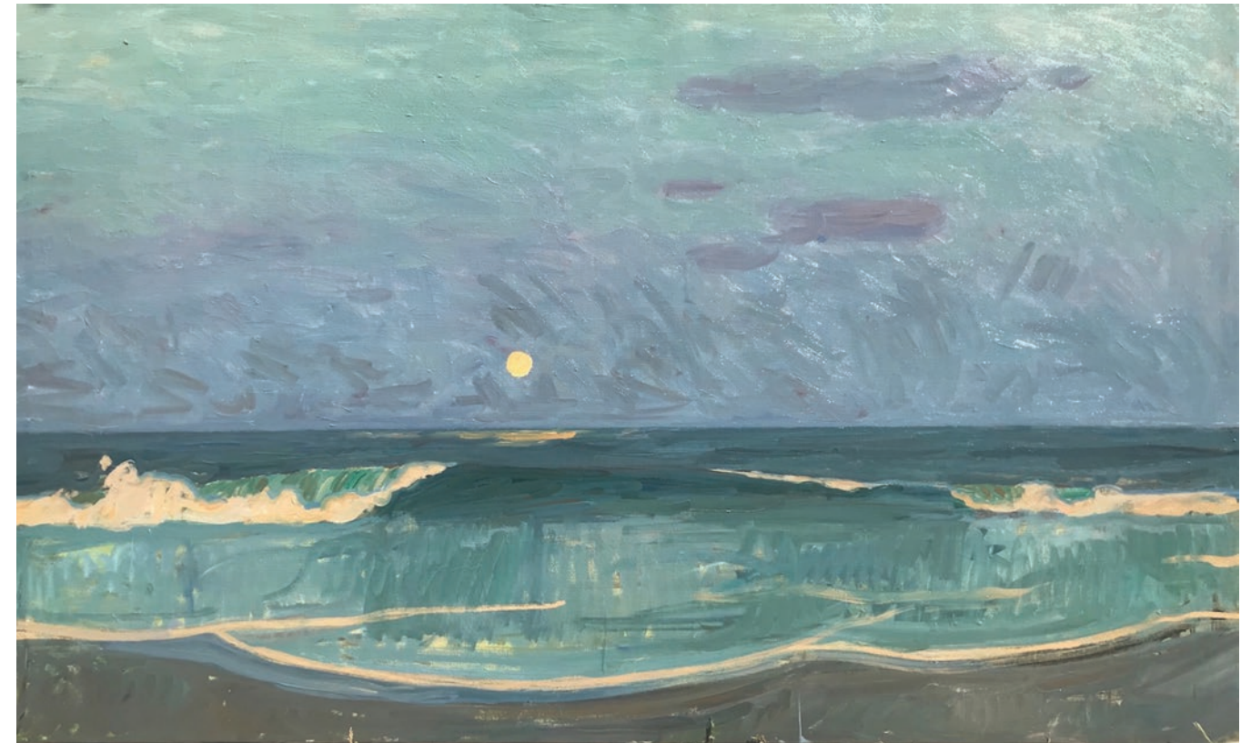
Gibson, Moonrise 39.5 x 63 inches | Oil on linen | 2020