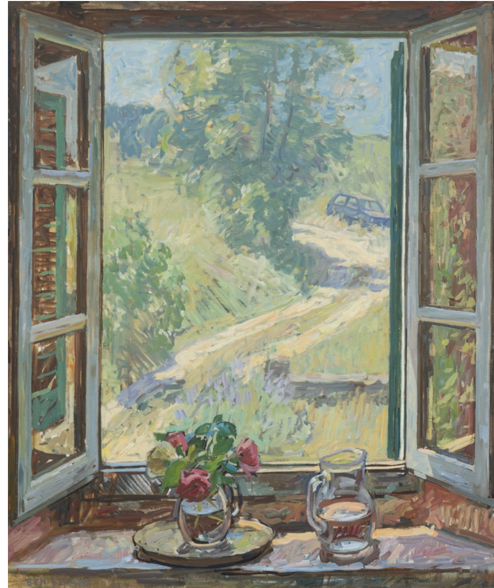
Open Window, June 47 x 39.5 inches | Oil on linen | 2021