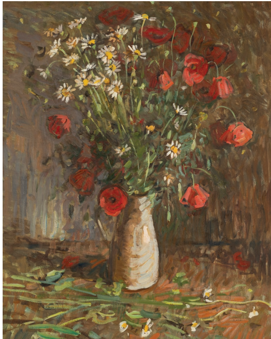
Spring, Wildflowers 35.5 x 29.5 inches | Oil on linen | 2023