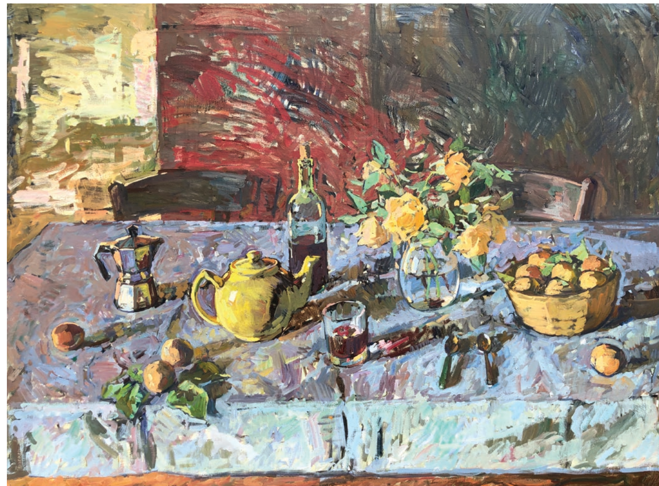
Fresh Apricots 43.5 x 59 inches | Oil on linen | 2020