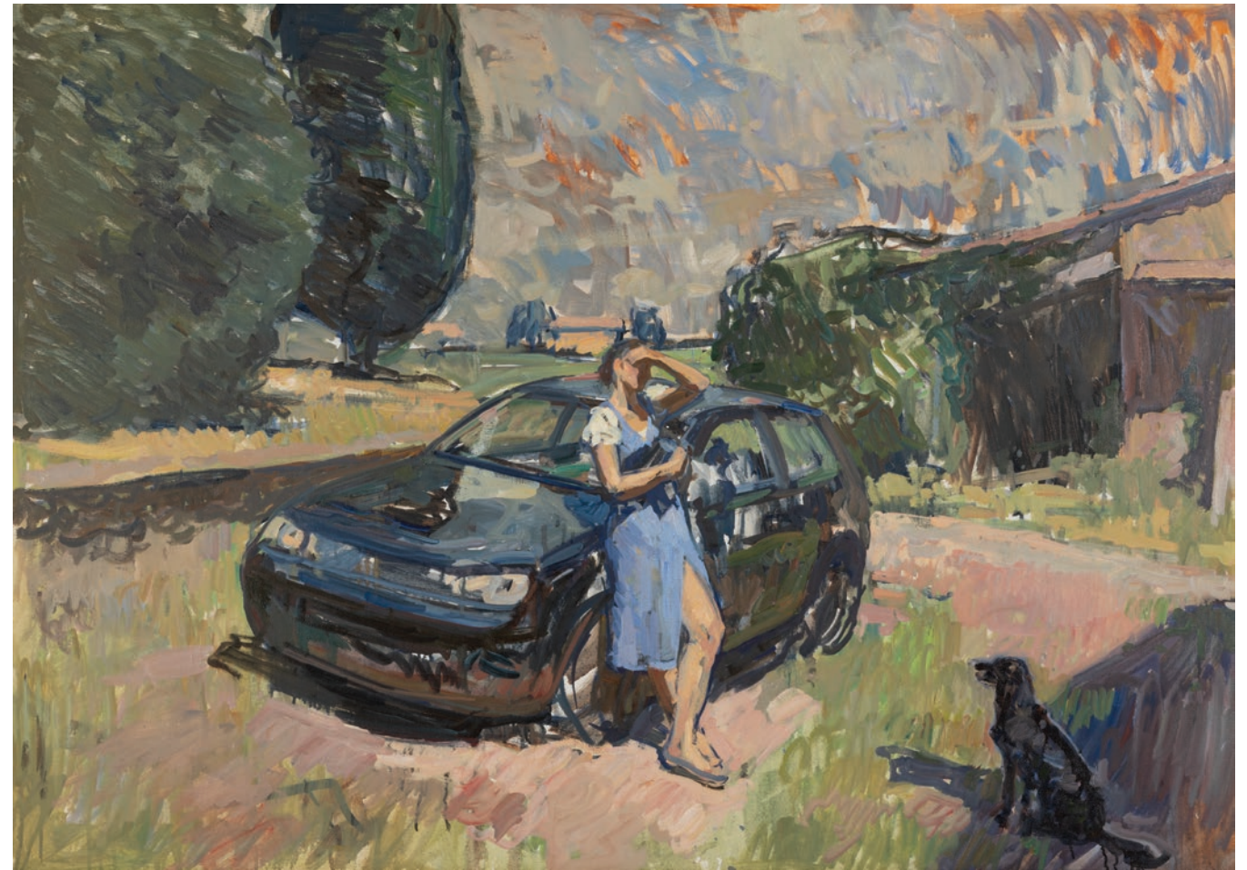
Golf 39.5 x 55 inches | Oil on linen | 2022