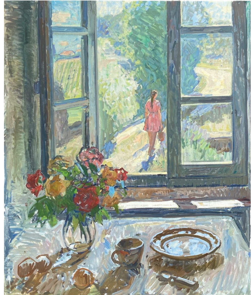
Amy Walking, Window 47 x 39.5 inches | Oil on linen | 2022