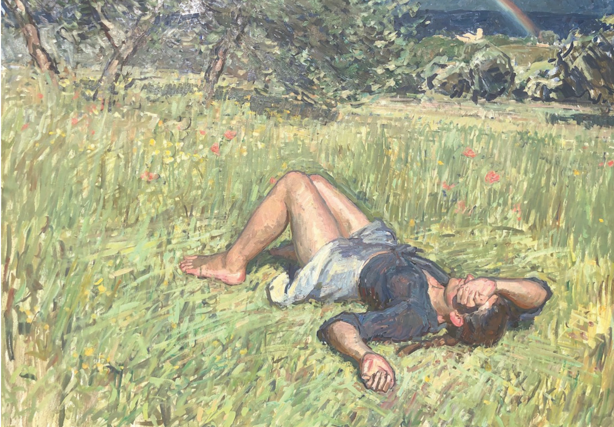
Andrà Tutto Bene | 47 x 67 inches | Oil on linen | 2020