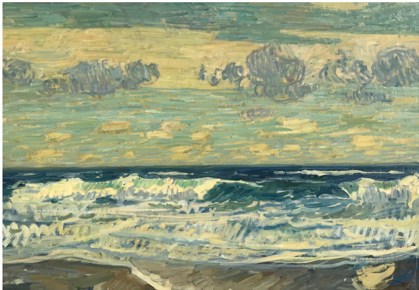
Sagaponack Waves 39.5 x 59 inches | Oil on linen | 2021