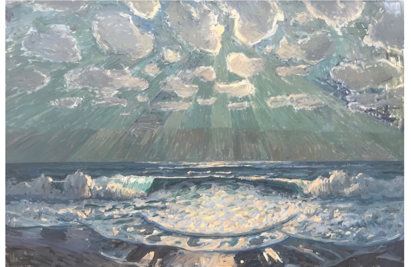
Sturgeon Moon 47 x 71 inches | Oil on canvas | 2020