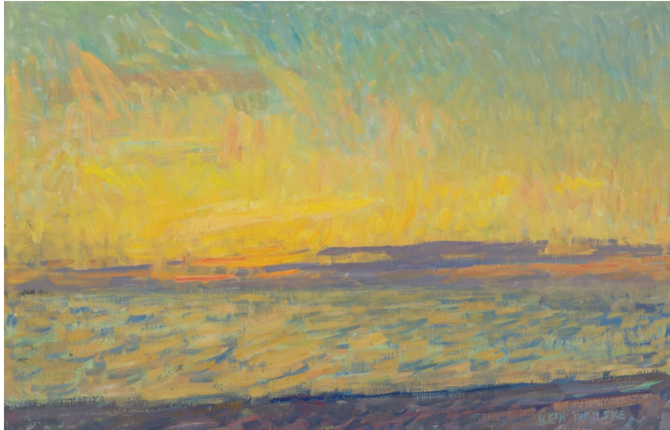
Soft Yellow Sunset 25 x 35 inches | Oil on linen | 2019