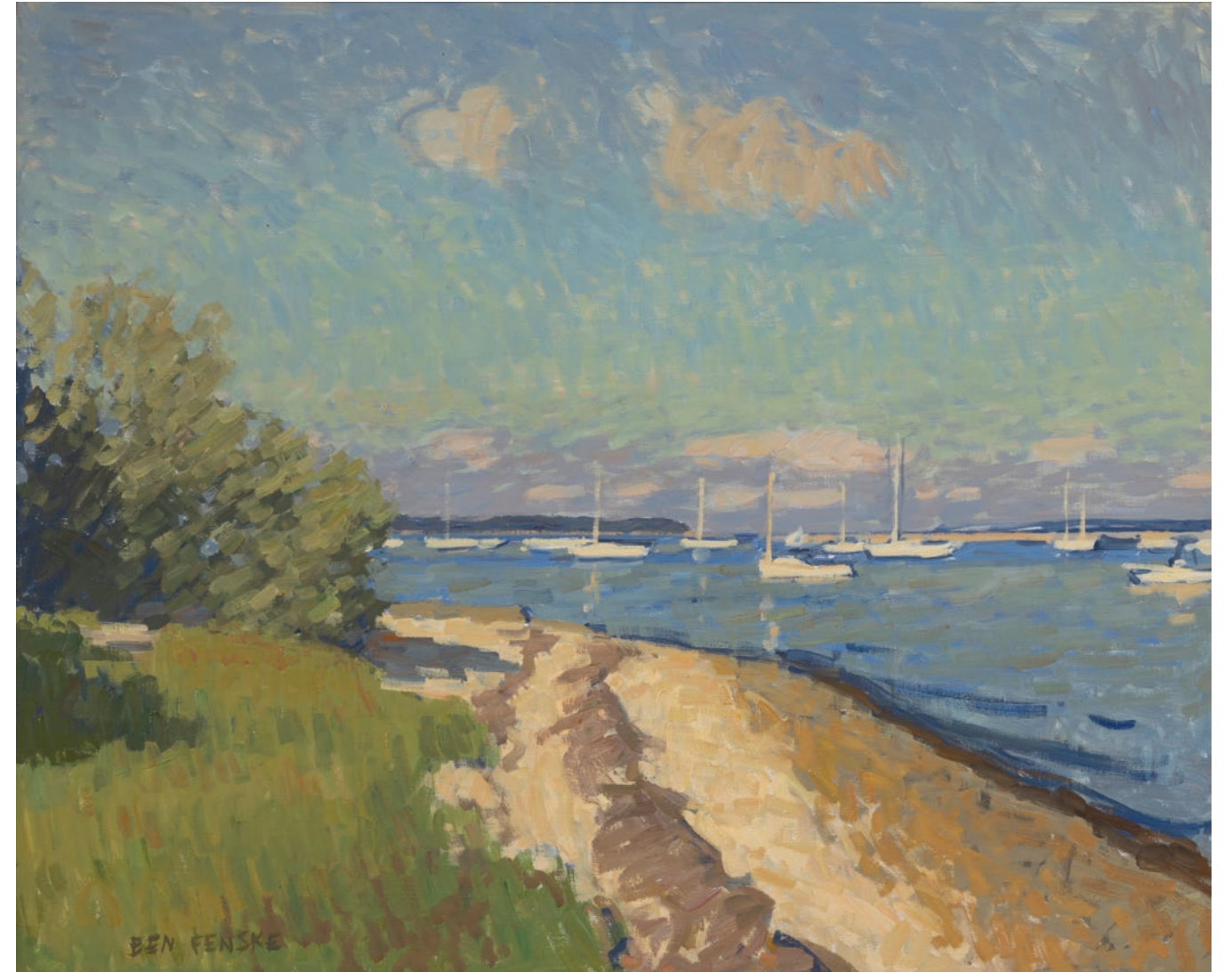
Boats Moored at Secret Beach 35 x 43 inches | Oil on linen | 2023