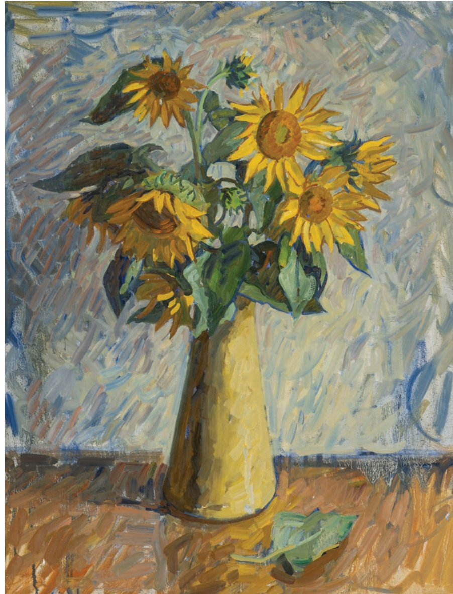
Sunflowers 35.5 x 27.5 inches | Oil on linen | 2023