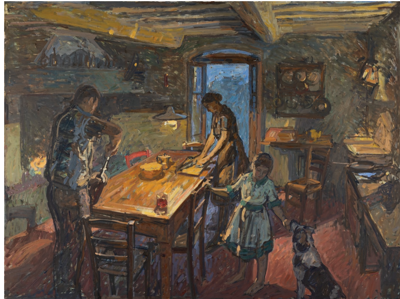
Kitchen 47 x 63 inches | Oil on linen | 2023