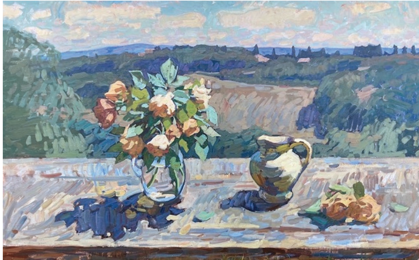
Roses Sunlight 2 28 x 47 inches | Oil on linen | 2022