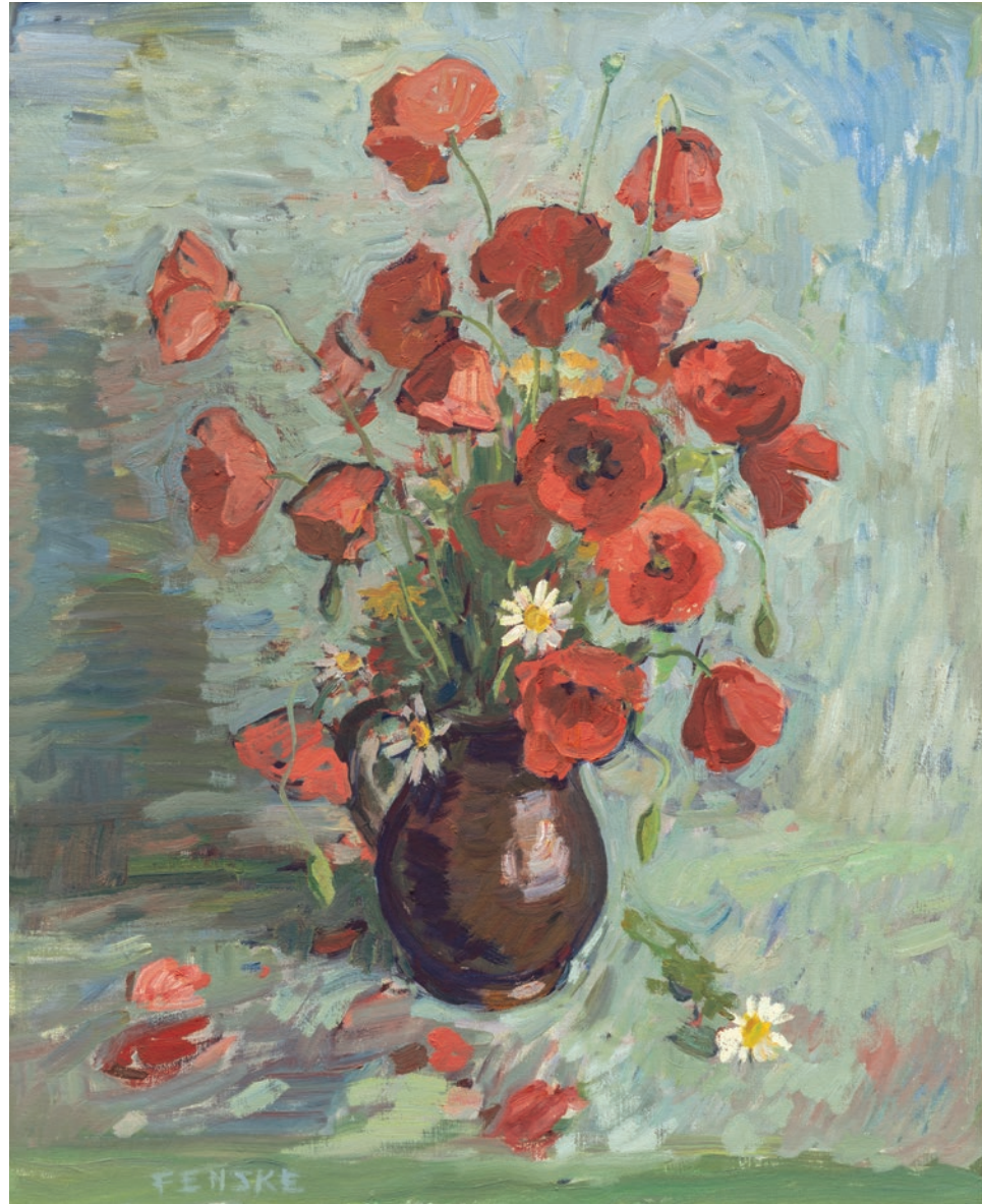
Poppies, Blue and White 23.5 x 19.5 inches | Oil on linen | 2021