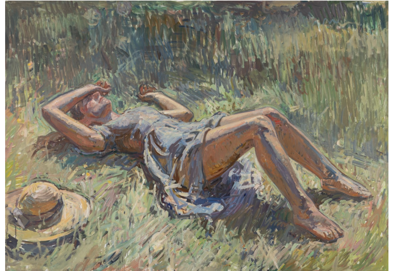
Girl, Sunlight 47 x 67 inches | Oil on linen | 2022