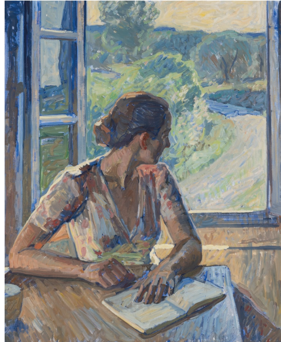
Window 43 x 35.5 inches | Oil on linen | 2023