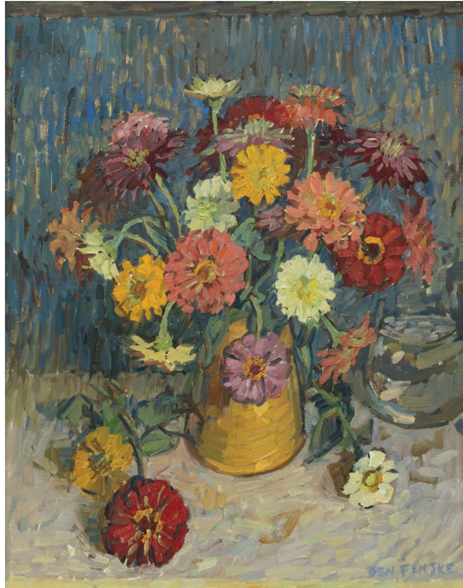
Zinnias 28 x 22 inches | Oil on linen | 2020