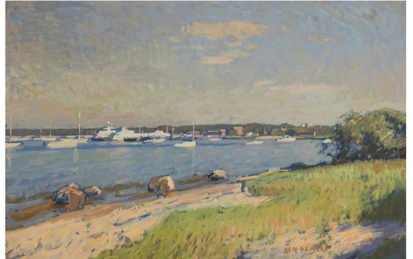
Sag Harbor from Secret Beach 31.5 x 47 inches | Oil on linen | 2023