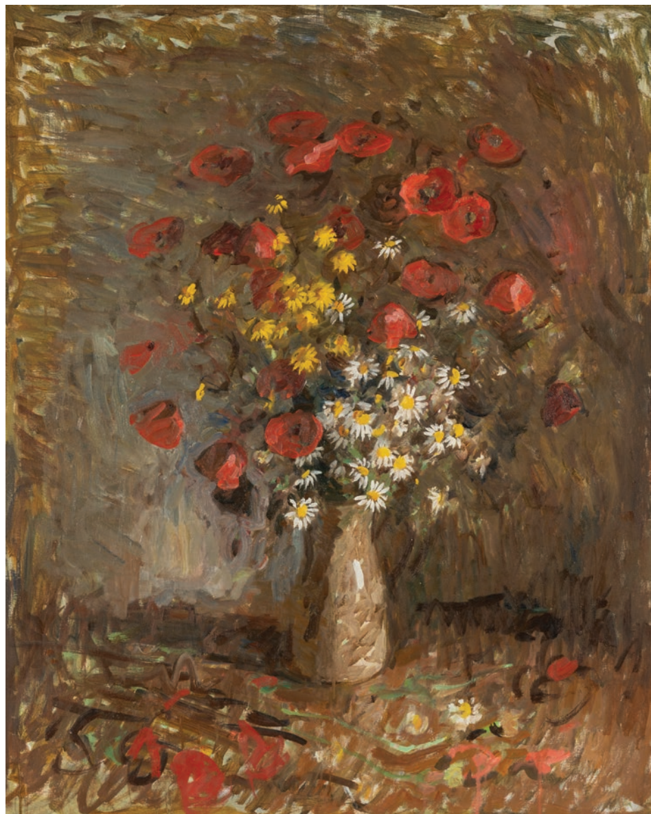
Poppies, Chamomile 39.5 x 31.5 inches | Oil on linen | 2023