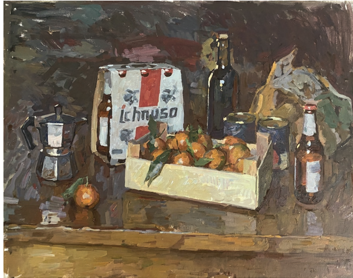
Winter Still Life 27.5 x 35.5 inches | Oil on linen | 2020