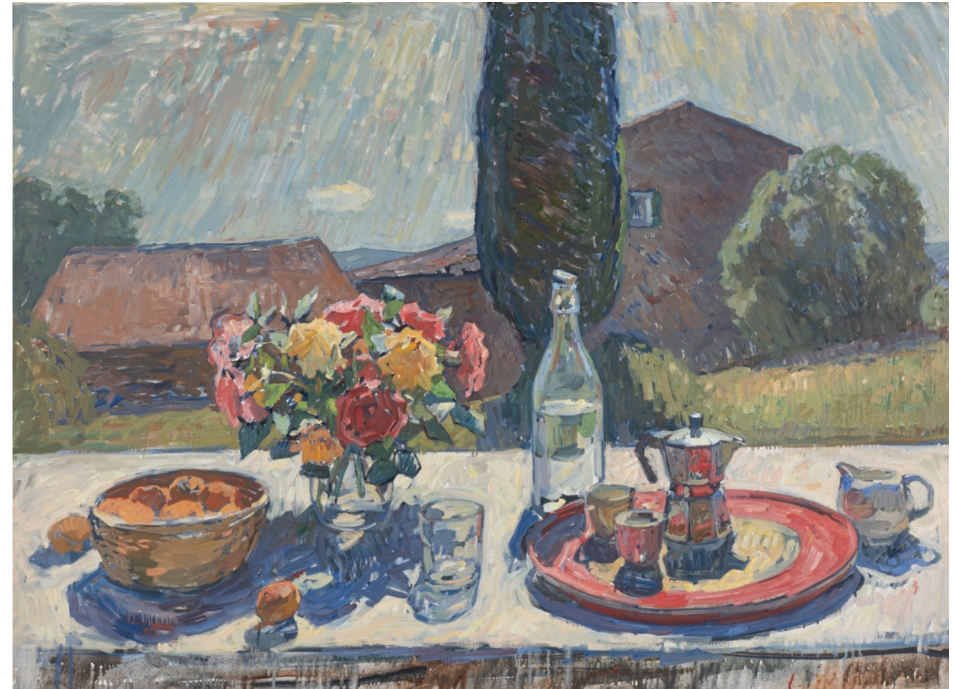
Still Life, Sunny Morning 43.3 x 59 inches | Oil on linen | 2022