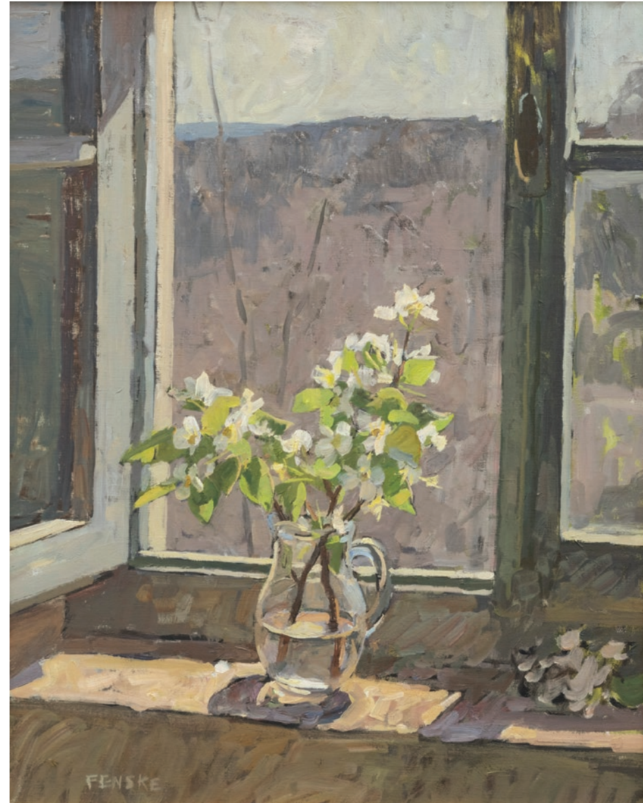
Spring Blossoms 31.5 x 25.5 inches | Oil on linen | 2021