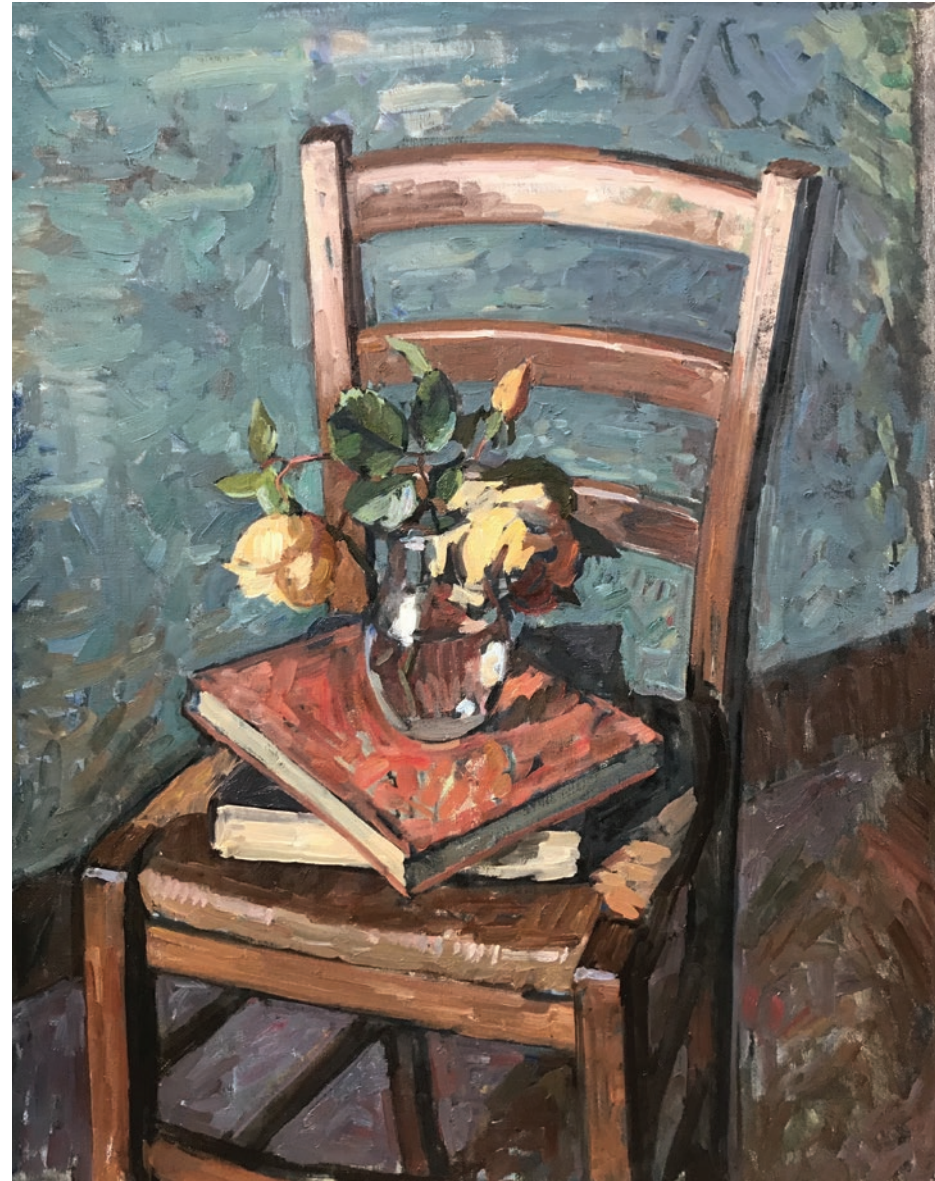
Roses on a Chair 31.5 x 25.5 inches | Oil on linen | 2021