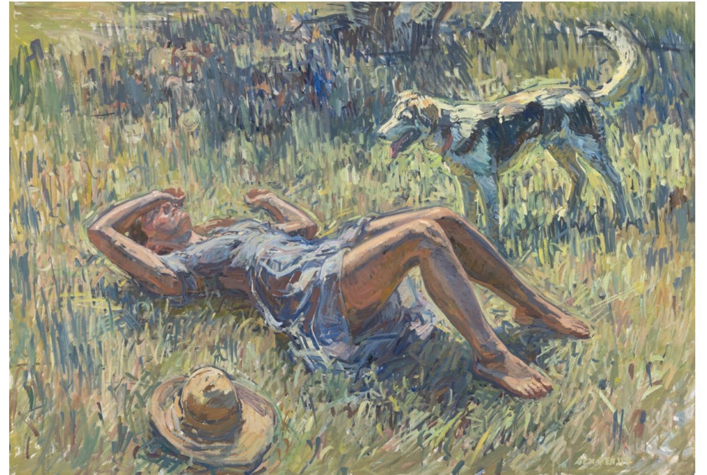
Girl, Dog, Early Summer 55 x 79 inches | Oil on linen | 2021